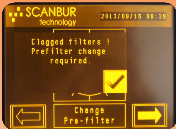
Touch screen display

The lowest row of air nozzles is located close to the floor level for maximum efficiency