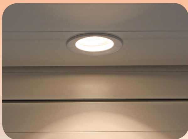
Spotlight inside the cabin