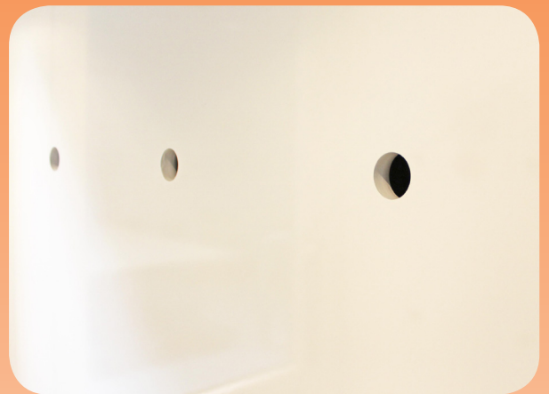
The air leaving the 30 nozzles with a diameter of 38 mm, has a velocity in excess of 30 m/s