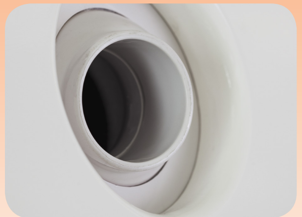
The movable nozzles (optional) ensure the correct direction of the airflow